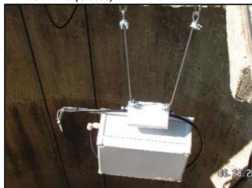
G2 Panel (installed in pump station)

In-Pipe's market opportunity is based on the volume of wastewater, expressed in the industry as millions of gallons per day (MGD), which can be treated biologically. A bottom-up calculation based on In-Pipe's business model would yield a US municipal market of approximately $1.6 billion annually with a world-wide market that may exceed $20 billion annually. Opportunities in the industrial markets may double or triple these estimates. As an example, GlaxoSmithKline produces in excess of 4 billion gallons of wastewater annually, which it treats and discharges – this is comparable to a WWTP that treats in excess of 12 MGD for a community with a population of 120,000.