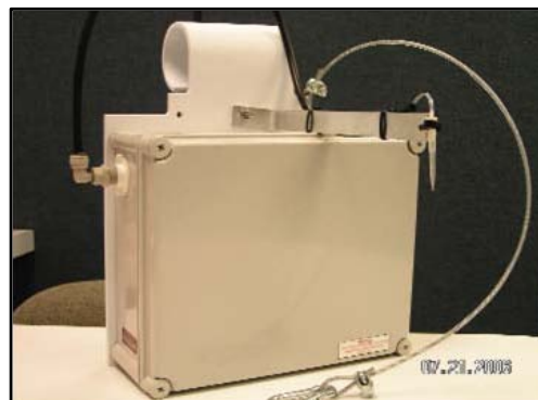
G2 Panel (Closed)

Utilising continuous dosing, the added bacteria become the dominant organisms and within a period of time, convert the biofilm on the walls of the system piping into a controlled, beneficial biological population, creating a pre-treatment reactor that selectively inhibits the growth of sulphate reducing bacteria (SRB) that produce unpleasant odours. They also metabolise fats, oils, and grease (FOG) in the collection system and at the WWTP. The enhanced biofilm acts as a biological reactor and provides beneficial treatment in the collection system by accelerating metabolic conversions and thereby reduces organic, nitrogen, and solids loads entering the WWTP. The bacteria are distributed throughout the collection system, stored in battery powered panels, and are automatically dispersed into the wastewater on an engineered basis.