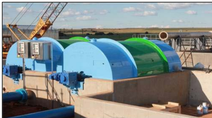
Installed BBI's SMART (Shaft Mounted Advanced Reactor Technology) units in South Africa

One of Aqua's portfolio companies, Bluewater Bio International ("BBI"), already commands a strong position in South Africa having recently won the contract for a wastewater treatment plant upgrade outside of Johannesburg. BBI is well positioned to win further contracts across the region by capitalising on this success and the attractiveness of the efficiency increases and cost savings generated by its proprietary HYBACS system.